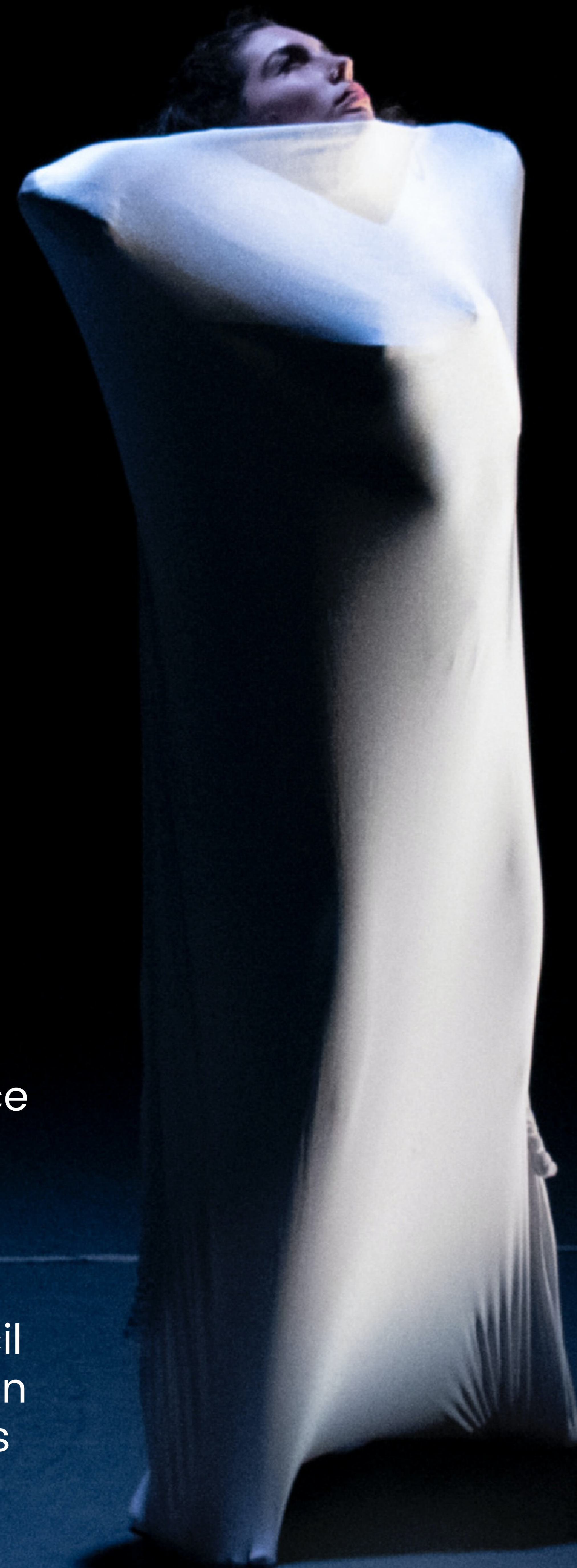
The Moving Architects Media Kit